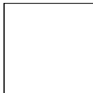
Figure A.1 This is another example of figure caption.

It is my passion for communication and people that will shine through me as a doctor.